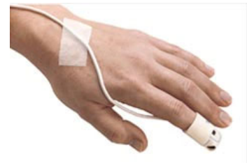
TSD124C Flex Wrap

The TSD124 series human oximetry transducers are reliable and simple to use on a wide range of subjects for both short-term and continuous noninvasive monitoring. The transducers incorporate Nonin's PureLight® sensors and are backed by a six-month warranty. Use with the OXY100E oximetry amplifier.