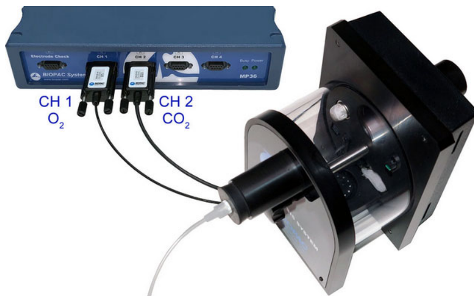
RX-GAS3 connected to MP36

The stopper includes a standard female Luer lock connector to interface to other equipment as well.