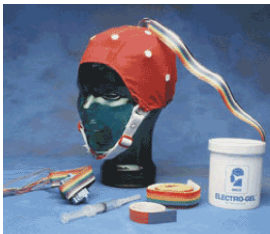
Electrode Cap System (CAP100C shown)

CAP-INFANT CAP-SMALL CAP-MEDIUM CAP-LARGE