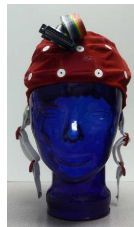
Cap only (CAP-MEDIUM shown)