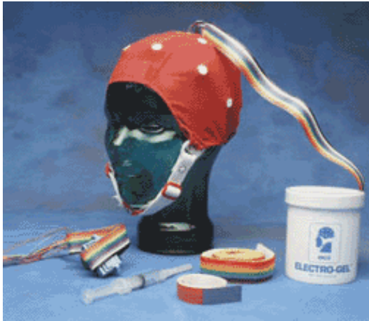
Electrode Cap System (CAP100C shown)

BN-CAP-SMALL CAP-INFANT BN-CAP-MEDIUM CAP-SMALL BN-CAP-LARGE CAP-MEDIUM CAP-LARGE