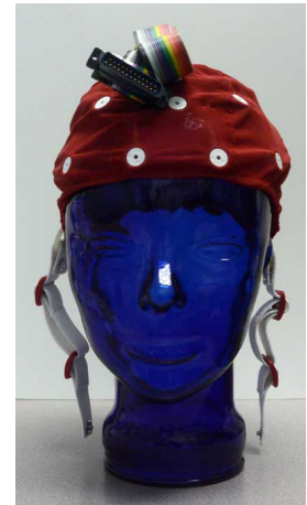
Cap only (CAP-MEDIUM shown)