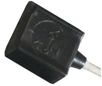
Tri-axial accelerometer uses 3 channel inputs

Tri-Axial Accelerometers connect directly to BIOPAC hardware and require no additional amplification. They provide three outputs, each simultaneously measuring acceleration in the X, Y, and Z directions. They are the same size and can be used on any part of the body or on external equipment.