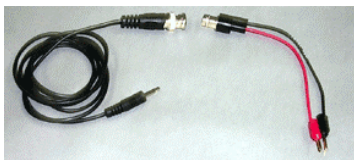
CBL102 connects to CBL106