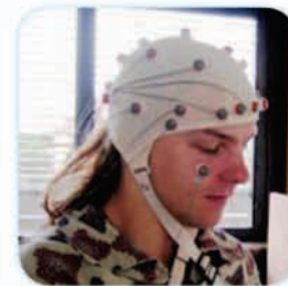
Conventional EEG cap & electrodes