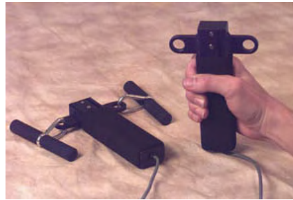
Hand Dynamometer Transducer shown with optional dynagrips

The multi-purpose hand dynamometer adds a new dimension to force measurements. This fully isometric transducer can be used in the traditional hand grip strength fashion, pulled apart by both hands, or mounted against a wall and pulled. The hand dynamometer can be used in isolation, or combined with EMG recordings for in-depth studies of muscular activity. The isometric design improves experiment repeatability and accuracy. The hand dynamometer is designed to interface with the DA100C General Purpose Transducer Amplifier (TSD121C) or the TEL100C remote monitoring module (SS25). The hand dynamometer transducer is the same for each system, but each uses a different connector and a different part number (as noted above). The equipment section of this application note provides you with a list of the appropriate part numbers and interfaces. With the proper equipment and correct scaling techniques described below, precise force measurements can be obtained.